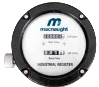
MH450 Industrial Register