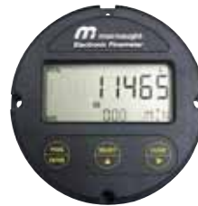
Standard LC Display