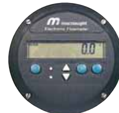
Deluxe LC Display