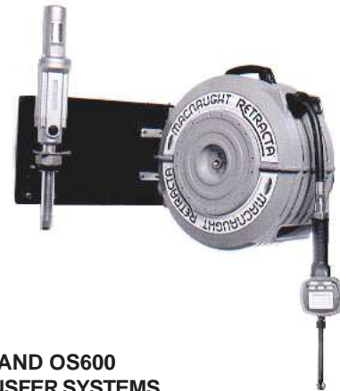
OS500 AND OS600 OIL TRANSFER SYSTEMS